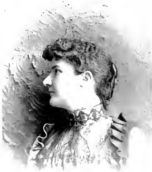
ELIZABETH GARVER JORDAN.

numerous "Sunday World" mountain stories afterwards, which were widely copied. She was promoted to the editorial staff of the "World," and has since edited the woman's and child's pages.